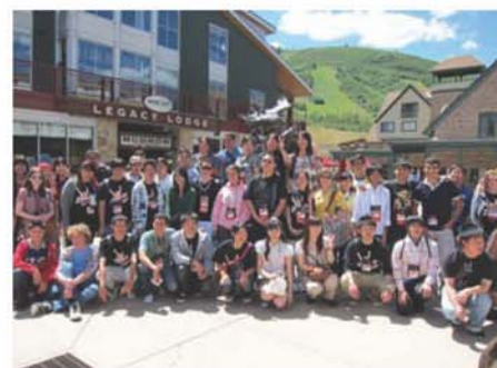
Delegates from different parts of the world took a group photograph in an outing activity (2010 MOS World Championship)

MOS is a globally recognized designation that proves users as truly knowledgeable in working with Microsoft Office applications. The MOS program is the only Microsoft approved certification program to measure and validate users' skills with the Microsoft Office suite of applications. MOS exams are currently available in 170 countries and 20 languages. Each certification exam corresponds to a particular Microsoft Office application (Excel, Word, PowerPoint, etc) and represents a single certification. The MOS exams are performance-based and delivered in a realistic setting simulating actual software operations.